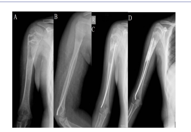
Figure 6: (A): 12 years old male child with right proximal humerus unicameral bone cyst; (B): 3 months follow-up X-ray showing resolving cyst; (C): 12 months follow-up showing recurrence of the cyst; (D): recurrence treated with curettage and bone grafting.