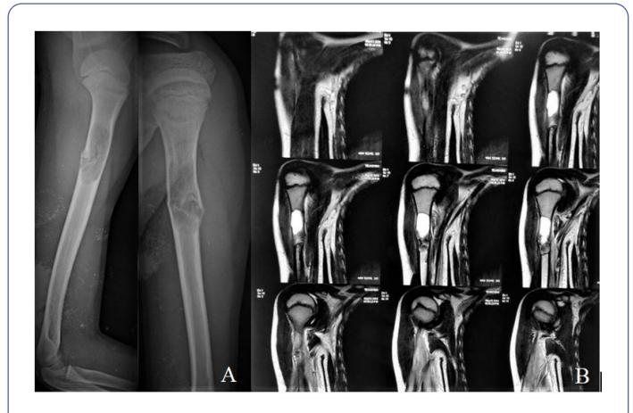
Figure 3: (A): Pre-operative X-ray of right Humerus of 10 years old female child with a unicameral bone cyst in proximal diaphysis; (B): MRI of the same patient showing 42 \times 14 \times 12 mm of the cyst with posteromedial aspect pathological fracture.

Post-operatively child was put on slab till suture removal because two flexible intramedullary nails provided adequate biomechanical stability. Shoulder movements were encouraged from 1st post-operative day. Injectable antibiotics for 3 days followed by oral antibiotics till suture removal. Prolonged use of antibiotics is practiced in our setup owing to a less hygienic environment in a rural government setup and low personal care and compliance. Regular surgical site dressing was done on 4<sup>th</sup> and 10<sup>th</sup> day post-operatively with suture removal after 10 days ( Figures 3 and 4 ). Strenuous activities were deferred until radiological evidence of fracture and cyst healing was appreciated on serial radiographs. Clinical and radiographic controls were performed at 4, 8 and 12 weeks and further after, 6 and 12 months. Criteria, as described by Capanna et al. [15], was used to classify the cyst healing.