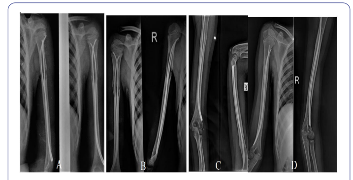
Figure 4: (A): Immediate post-operative radiograph showing the cyst with 2 flexible intramedullary nails in humerus; (B): 4 weeks follow-up;(C): 6 months follow-up showing resolving cyst in right proximal third humerus; (D): 1-year follow-up Xray showing complete resolution of the simple bone cyst.