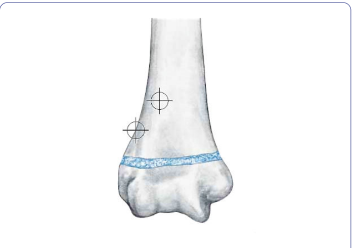
Figure 2: Entry point for retrograde insertion of two flexible titanium nails.

With a child under general anaesthesia, under fluoroscopic guidance. 2 flexible titanium nails (implant from SHARMA Orthopaedic (India) Pvt. Ltd). are selected according to the diameter of the medullary canal. Entry site being posterolateral to the lateral supracondylar ridge, 2 cm proximal to the distal humerus epiphysis. After incision over the lateral supracondylar ridge, with bone awl entry site is made. Titanium nails appropriate for the child are selected, usually, 2 or 3 mm based on the width of the medullary canal. Nails are pre-bent to have a three-point fixation configuration in the medullary canal. Two nails are inserted one after the other under the image intensifier guidance avoiding the proximal and distal humerus epiphysis. Nails are passed in a retrograde fashion one proximal to the other till the proximal humerus metaphysis. Before wound closure, the ends of the nails were trimmed to an extent they are 1cm outside the bone. Care is taken such that the protruded ends do not irritate the soft tissue surrounding it and also allow for easy removal (Figure 2).